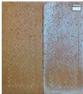
Ceramic bricks with and without SurfaPore R after immersion in saltwater for 24 hours

Water Vapor Transmission of materials (ASTM E96): Water Vapor transmission loss was determined as the rate of water vapors pass through a 2cm thick ceramic sample. Vapor Permeability Loss: 4.94% (surface application).